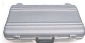
Carrying Case #004153

For use with: FS-155, FS-200, FS-236, IFS-8 & 0 ID Kits