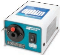
MS-24 AC Light Source #004793 Kit Includes: Light Source, power supply and wall cord.