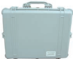
Heavy Duty Carrying Case #005205

For use with: FS-155, FS-200, FS-236, IFS-8 & 0 ID Kits