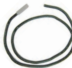
OPTIM Flex & Stay Fiberscope Guide Tube 40" Length #4093421 60" Length #4093422 80" Length #4093423 120" Length #4093424

For use with: OID Kits & FreedomView Kits