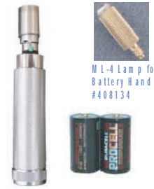
Battery Handle Illuminator #413126 Requires 2 C-Cell Batteries