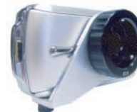
Digital Camera and Coupler Kit #005769