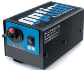
MS-48 AC/DC Light Source System #005126 Kit Includes: Light Source, power supply and wall cord (for light source); power supply and wall cord (for battery charger); lithium ion battery charger; one lithium ion battery and shoulder bag

For use with: MS-48 Replacement Battery #005008 Cigarette Lighter Cord #005129 Dual Battery Charger #005006 Shoulder Bag #005181