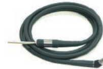
Universal Light Guide Cable #433075

For use with: FS-155, FS-200, FS-236 & 0 ID Kits