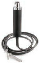
FL-12 Bayonet Mount Light Guide Handle #412041

For use with: FS-100 & FS-101, IFS-8 & 0 ID Kits