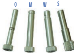
Multiple brand Light Guide Adapters (from left to right) Olympus #004098 Machida #4118115 Wolf #4120755 Schott 1500KL #408886

For use with: FS-155, FS-200, FS-236 & 0 ID Kits